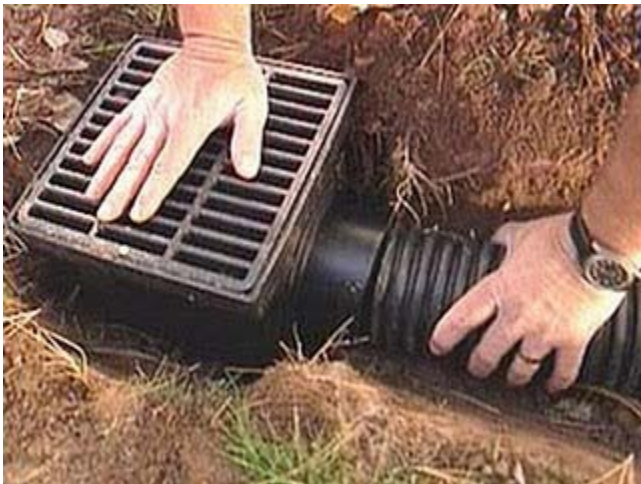
Catch basins and drain tile capture rainwater from downspouts and direct it away from foundations.

If water accumulates around your home, it could cause foundational abnormalities that cost a lot to fix. Properly designed drainage can protect your home from wet basements and flooding by moving water away from your foundation. Standard installation products include catch basins and drain tiles that help move water to desired locations.