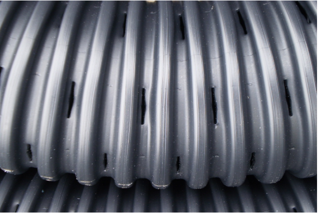
Perforated drain tile installed underground lets water seep into the subsoil.

Installing proper drainage is also important for plant and tree health. Some plants are well suited to damp areas, but chances are most of your valuable landscape flowers, shrubs and trees will suffer and rot if they are subject to standing water for very long. Soggy landscape areas can result in soil erosion and also are a breeding ground for mosquitoes and other undesirable insects. One way to avoid these issues may be to install perforated drain tile and move excess water to areas where it can be absorbed into the soil. Not all yards are the same and many solutions exist when dealing with standing water problems. Hiring a professional landscaper experienced in drainage design is highly recommended.