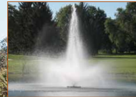
A LINDEN PATTERN - 3HP