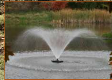
C WILLOW PATTERN - 3/4 HP