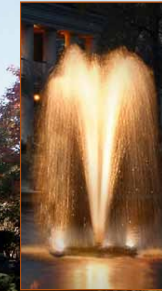
G SEQUOIA PATTERN WITH LIGHTING - 3/4 HP