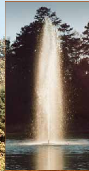
E REDWOOD PATTERN - 3HP

3/4 hp & 1 hp = 5 patterns, 2 hp & 3 hp = 6 patterns, 5 hp = 7 patterns 3-phase now available in 2, 3, and 5hp