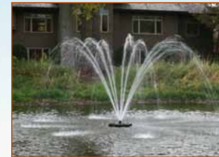
B CYPRESS PATTERN - 3/4 HP