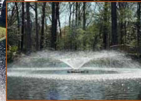
D JUNIPER PATTERN - 3/4 HP