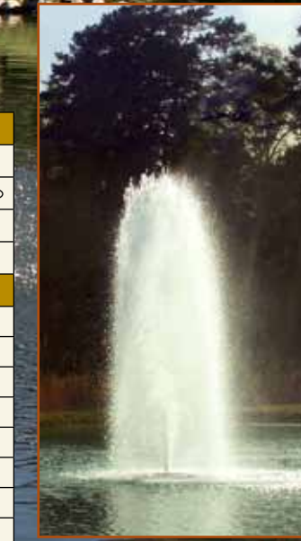
H BIRCH PATTERN - 3HP