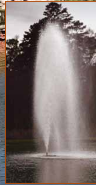
F SPRUCE PATTERN - 5HP