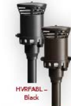
HVRFABL – Black