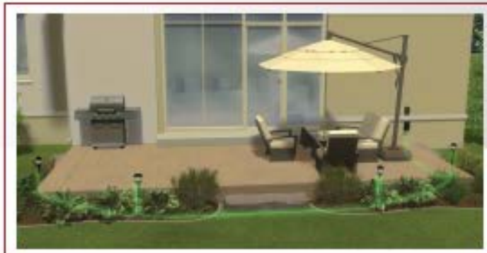
Easy installation using transformer and landscape cable. Install fixtures every 10 to 12 feet around the area you would like to protect.