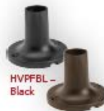
HVPFBL – Black

Fixtures include easy-to-use cable connector and adaptors.