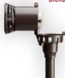
HVRFABR – Bronze

Child-resistant fixture opens with screwdriver for easy repellent cartridge replacement.