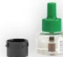
HVRC1 – Single Pack