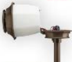
HVLFABR – Bronze

Child-resistant fixture opens with screwdriver for easy repellent cartridge replacement.