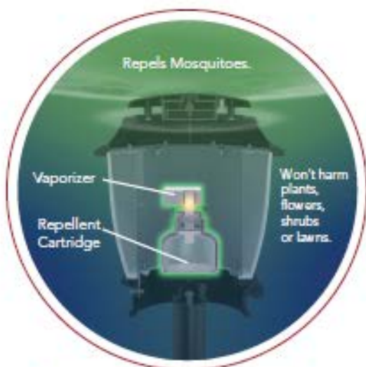
Patented mosquito protection technology powered by low voltage electricity.