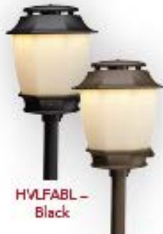
HVLFABL – Black